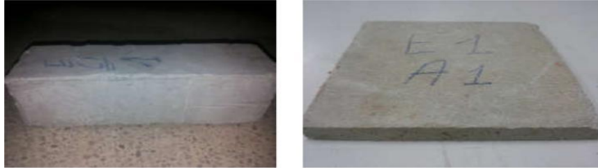
Figure 1 Specimens made by addition of paper treated with cement and clay.

cm 2 ) with a length of 16 cm. Both types of specimens were then dried for 2 hours in an oven at a temperature of T = 105^{\circ}\text{C} . Finally, the whole was treated in an oven at a temperature of 300^{\circ}\text{C} during. Both types of specimens were then dried for 2 hours in an oven at a temperature of T = 105^{\circ}\text{C} . Finally, the whole was treated in an oven at a temperature of 300^{\circ}\text{C} during.