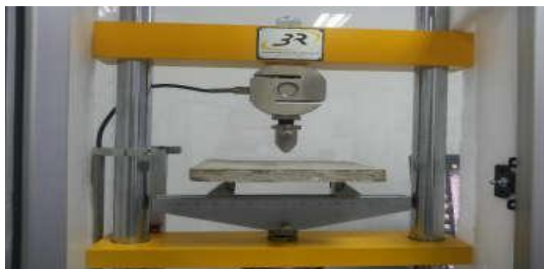
Figure 3 Machine brand KERNEL SISTEML (0 + 400kg) [9].

For rectangular specimens, a flexural test was used to evaluate the maximum stress at break, the latter was determined by three-point bending on bars of length l = 20 cm and thickness ( e=2 cm). Maximum stress was achieved using a KERNEL SISTEML brand machine (0 + 400 kg), (see figure 3). The test piece is held on two simple supports, distant of L = 16 cm. A charge F_r is applied at a point equidistant from the two supports.