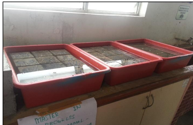
Figure 1. Specimens immersed in sulphate solution.

Sulphate resistance test was conducted in order to determine the durability performance of OPS LWAC containing FA as partial sand replacement performance towards sulphate attack. The sulphate solution was prepared according to ASTM C1012 [6]. The degree of sulphate attack was evaluated by measuring mass change of samples of 100 x 100 x 100 mm concrete cubes. Then, six specimens from each mix were immersed in 5% sodium sulphate ( \text{Na}_2\text{SO}_4 ) solution as shown in Figure 1. Mass measurement and visual assessment of the concrete were conducted every week until the age of 5 months.