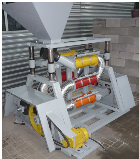
Figure 3. A general view of the centrifugal grinding unit with parallel blocks

The result of the complex research is the development and creation of a new design of a centrifugal grinding unit with parallel grinding blocks (Fig. 3), the technical characteristics of which are presented in the table.