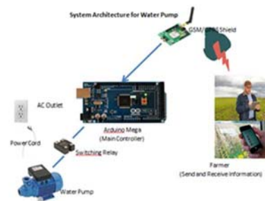
Figure 2. System Architecture for Water Pump