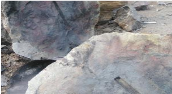
Figure 2. The rock is cut into two pieces

The specific cutting test, the crushing test selected in a quarry, the rock nature belongs to ordinary rock.