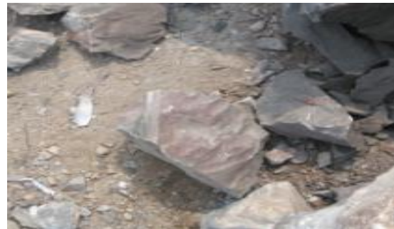
Figure 3. Rock fragments after blasting