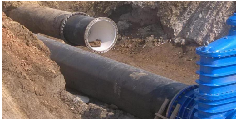
Figure 2. Test site

2.3.1 Test site. The test time was completed on March 17, 2016 with the highest temperature of 20°C and southwest wind 5. The site is located at Yunxiu Road, Guandu District, Kunming, and its location information is 102.7496383335 degrees north latitude, 24.945505004 degrees east longitude, and altitude of 1980.6 meters. The site environment is shown in Figure 2. The pipeline is composed of single seamless steel pipe with length of 6m by welding together. Its material is carbon steel, diameter is 1200mm, and wall thickness is 14mm. The pipeline is buried 5m underground with length of more than 500m. Its one end is open access. Signal detection device is shown in Figure 3.