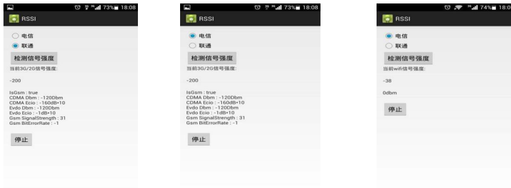
(a) Unicom 3G signal detection (b) Telecom 3G signal detection (c) Wi-Fi signal strength detection