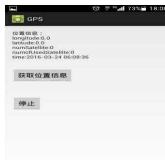
Figure 6. GPS location detection APP

In order to test the acquisition of GPS location information in underground pipeline, we developed APP software that can read GPS location information under the Android platform. It can record the number of satellites and real-time location information, and store the results and time points in the database, as shown in figure 6. The test scheme is the same as before.