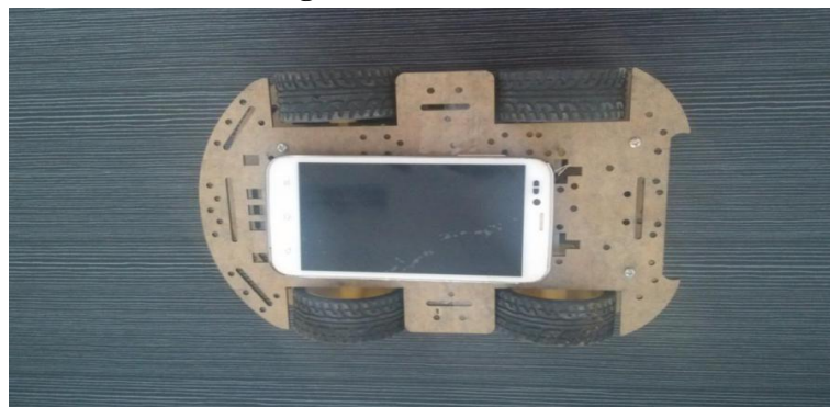
Figure 3. Signal detection device