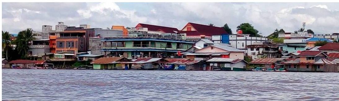
Figure 5. Floating houses as foreground of urban scenery in Sintang

Unlike in the past, today there are not many Malays who are still living in floating homes. The availability of large quantities of land at relatively low prices, particularly in the floodplains of Kampung Raja across the river, has made Malays to choose to live on the land, above the surface in their stilt houses, still maintain the character of local traditional rural living. This is consistent with the ideas of Evers and Korff (2002) that Malays tend to choose to live in kampongs, even though these kampongs are administratively located within the city. The life of Malay people tends to circulate predominantly around the palace and the mosque, rather than in the entire city. That is in contrast to the Chinese way of life. Although most Chinese immigrants who arrived in Indonesia came from the rural areas in southern China, their lifestyle is urban in its essence. The concept of densely populated neighborhood settlements located in the city centers is typical of the Chinese communities in almost all Indonesian cities, and Sintang is not an exception. In other words, the areas of the city that have a distinctive urban character are usually the areas inhabited by the people of Chinese origin, while the areas populated by Malays are still retaining the character of the kampong (local traditional village).