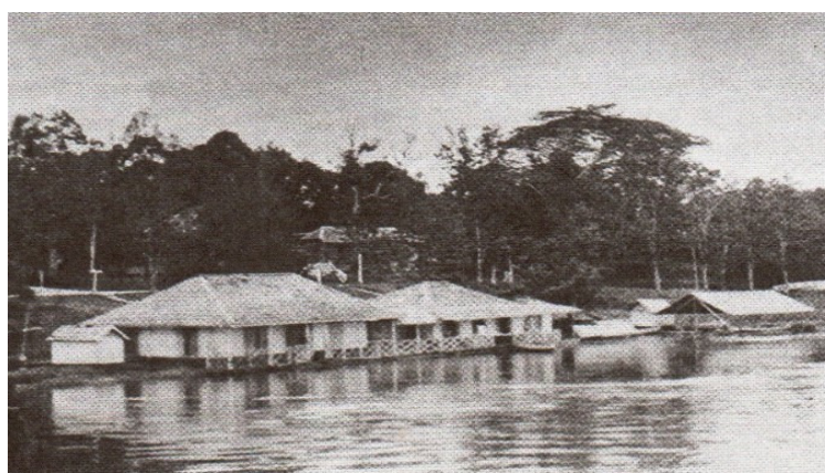
Figure 4. Floating hospital in Sintang, ca.1920

Being located at the confluence of two large rivers had made Sintang an important trading center with abundance of natural resources that could be found in the surrounding area. The rivers were not only important as transportation routes, but were also providing abundant amount of fish for people's livelihood (Enthoven, 1905). On land, the Dayaks used to extract bird's nests from the crack in the rocks of Mount Kelam, selling them to the kingdom, at a low price. Wax collected (by hundreds of loads) was a very important commodity during that time. The soil was also capable of producing a good quality rice, meeting the needs of the entire inland settlements during the harvest season. Rattan was easily found in the forest and along the Melawi's riverbank. Best quality gold was mined at various spots, as well as iron ore, grindstone and magnet (Heidhues, 2003).