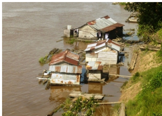
Figure 2. Floating houses in Kapuas River

After the construction of roads in the inland Borneo (around 1950s), the conditions of the river deteriorated. There were many illegal gold mining activities along the riverbanks; the waste was habitually and directly dumped into the water of the river. That made the river contaminated by the mine waste, including mercury (Cleary, 1992). The river that was once used as the source of clean water and fish became gradually ‘unreliable’, due to the high level of pollutants and sediments. Until now, all types of waste are increasingly polluting the Kapuas River, ranging from household waste, from pesticides and plantation fertilizers, to mercury.