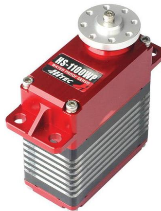
Figure 2. Servo Drive HS-1100WP

The servo drive HS-1100WP Ultra-Heavy Duty, Giant, Waterproof Servo was chosen (Fig. 2).