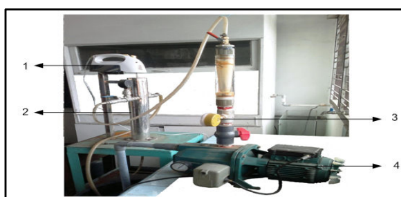
Figure 1. Membrane module

The materials used in this study were PSF as a mixed polymer solution dope, DMF as the solvent, Aquadest as nonsolvent, Solution dope PSF as the casting solution, and the wastewater POME derived from Aerobic ponds effluent as feedstock sample. While the membrane operating equipment consists of a set of membrane module. The membrane operating apparatus was a set of membrane modules to testing the membrane performance as follows.