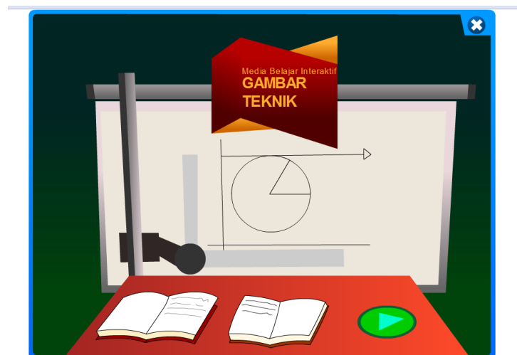
Figure 2. E- MMAED preview.

At the beginning of the opening E-MMAED will appear as shown in Figure 2, which consists of: Syllabus and RPP, Instructions for Use, Play button.