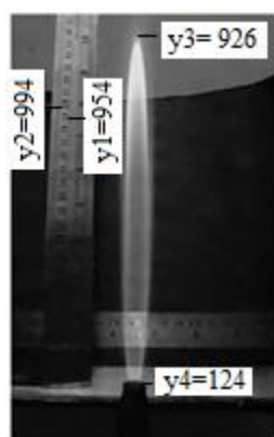
Figure 2. Determining the dimensions of flame through the photo

The measurement of flame dimensions was done using photograph. Figure 2. Shows the dimensional determination of flame by using adobe photo shop from digital photos by comparing the number of pixels on the scale of the ruler with different pixel values on the height of the flame.