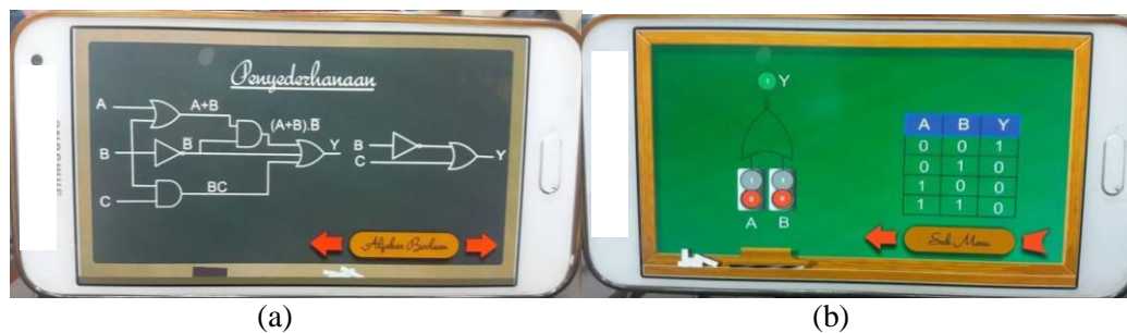
Figure 1. a).Logic simplification; b). NOR gate's interactive circuit

The contents were developed in order to put an emphasis on demonstrating and assisting each theoretical concept with a practical application. Another important feature is the use of images and multimedia animations. As an example, Figure 1a shows a material about the Boolean algebra. With this image, students can see the logic simplification. Several interactive figures have been developed for the understanding and motivation of the students. Figure 1b neither shows an interactive circuit for NOR gate. Students can change the input of the gate to show the output of gate that they want to see.