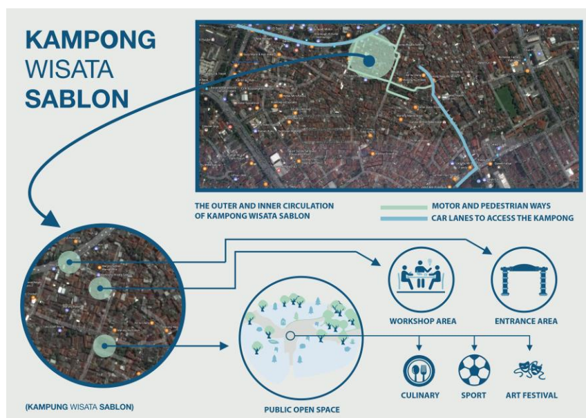
Figure 5. Tourism schemes in kampong wisata sablon