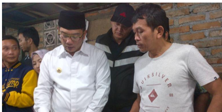
Figure 4. Mayor of Bandung in visit to a Kampong Wisata Sablon

The presence of the City Government should be a stimulus for the community the kampong to raise the potential of tourism in the area, according to Ridwan Kamil when his visit to the kampong says that must be packed in kampong fascinating, because if not packaged interesting then just going into an economic hub, will not come to the stage of attractions.