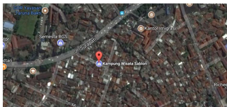
Figure 1. The location of Kampung Wisata Sablon, Bandung.

Kampung wisata sablon is located in the old Muararajeun Bandung, West Java. Its location is in the North of Bandung and the Immigration Office just south of SDN Cihaurgeulis 2. This Kampung is now a center of economic activities of populist-based small and medium enterprises where more than 70 distribution outlets and clothing both inside and outside the country in production in this kampung.