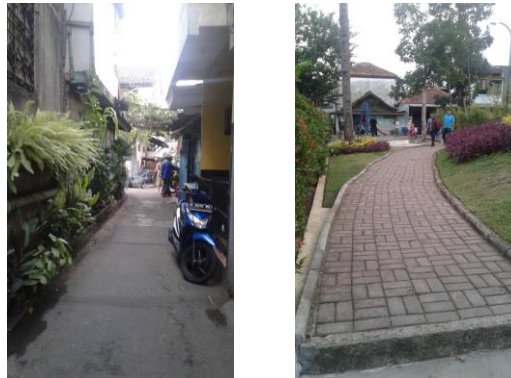
Figure 2. Condition of Alley, Parking, and walking

From the explanation above, the architecture can appear as a solution, the problem can be solved together with the city of Kampong – either along the citizens in participatory by presenting architecture as objects are discussed in it, citizens are invited to the same – same importance of conscious life, ideally in terms of thermal comfort, health or visually exist in the theory of architecture, when citizens realized it would be the creation of a good environment and arranged overall, ultimately will contribute to urban design.