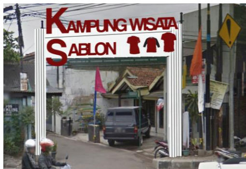
Figure 6. Main Gate Design Proposal of Kampung Wisata Sablon

To enliven and facilitates the needs of travelers in addition to the printing experience the culinary experience, the typical Bandung, and if possible, a special residence provided for travellers who want to stay, and provides open space specifically for organizing entertainment for the local community.