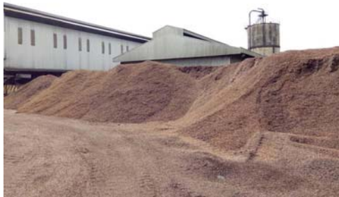
Figure 1. OPS at the palm oil mill.

The fly ash used in this research was obtained from a coal fire plant located at West Malaysia. Fly ash of 0%, 10%, 20% and 30% by sand weight was added as fine aggregate replacement. Oil palm shell (OPS) was use to fully replace conventional coarse aggregate to produce oil palm shell lightweight aggregate concrete (OPS LWAC). The OPS was used in this research was procured from a local palm oil extraction factory as illustrated in figure 1. At the laboratory, the shells shown in Figure 2 were cleaned from impurities before using. OPS having a moisture content, water absorption, fineness modulus and specific gravity value of 12.45%, 12.47%, 6.53 and 1.37 kg/m 3 were used respectively. The bulk density of OPS used in this research is 568 kg/m 3 which is in the range of 500-600 kg/m 3 . This value is in line with the OPS bulk density done by previous researchers [9,10]. The physical properties of the OPS used in this study are tabulated in Table 1.