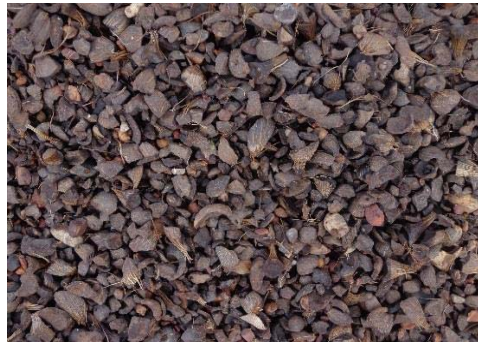
Figure 2. Oil palm shell (after cleaning).