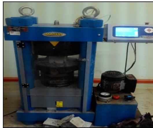
Figure 3. Concrete mixes was filled in cube mould. Figure 4. Compressive strength test in progress.