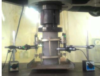
Figure 2. Compressive strength test