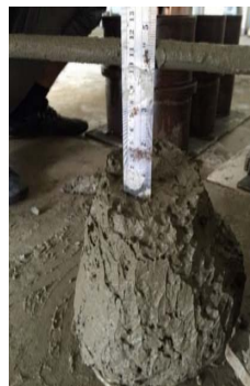
Figure 1. Slump Test.

Fresh concrete had a slump value of 9 cm with met the slump design of 10 \pm 2.5 cm. Visual observation (figure 1) revealed that fresh paste made with sea water and PCC could maintain the workability and homogeneity of the mixture without segregation, bleeding did not occur, and no coarse aggregates pilling at the bottom of specimen.