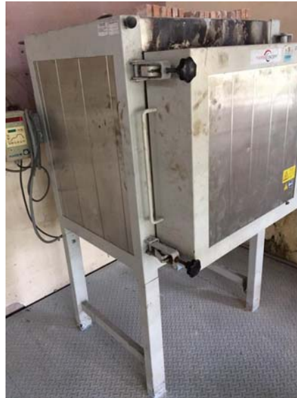
Figure 1. KC 80/15 furnace