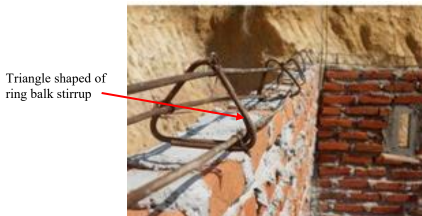
Figure 2. The triangular stirring shape for the beam ring