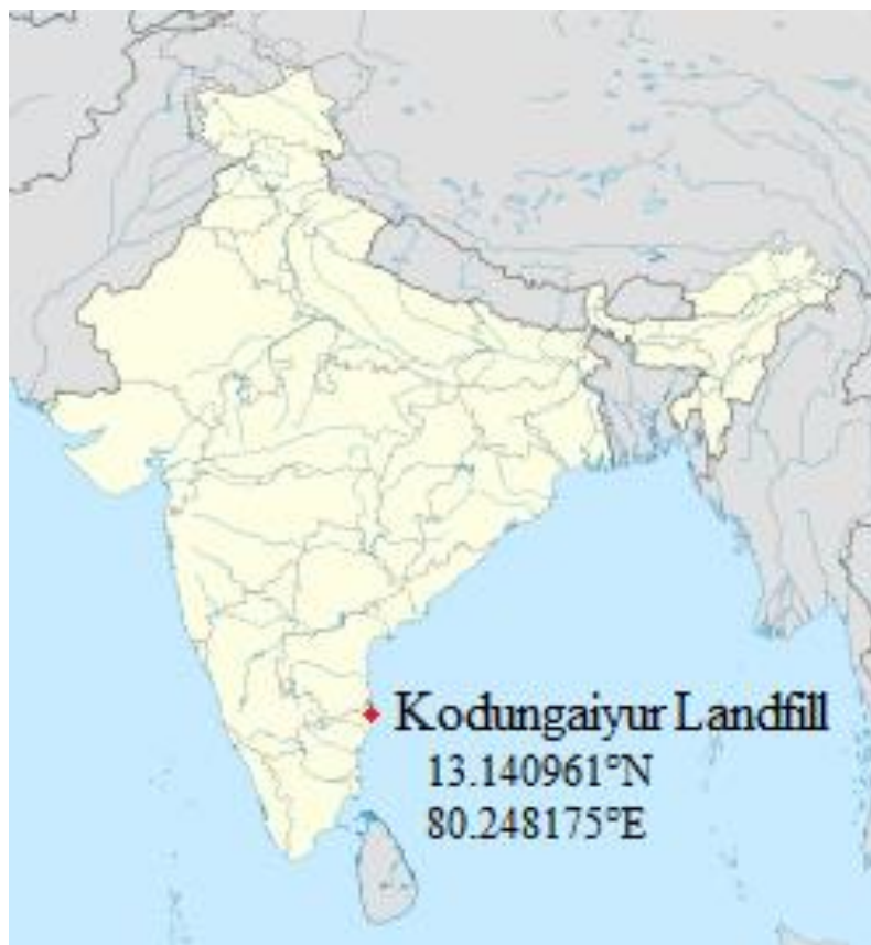
Fig.1. Kodungaiyur landfill on the Indian map

Electrical conductivity serves as an effective tool to quantify the hazards to crops caused by salinity. The EC of the sample is compared with the EC classification guidelines (Table 3), and it was arrived that three samples fall under doubtful class and one sample fall under good category, and the other five samples fall under the unsuitable category.