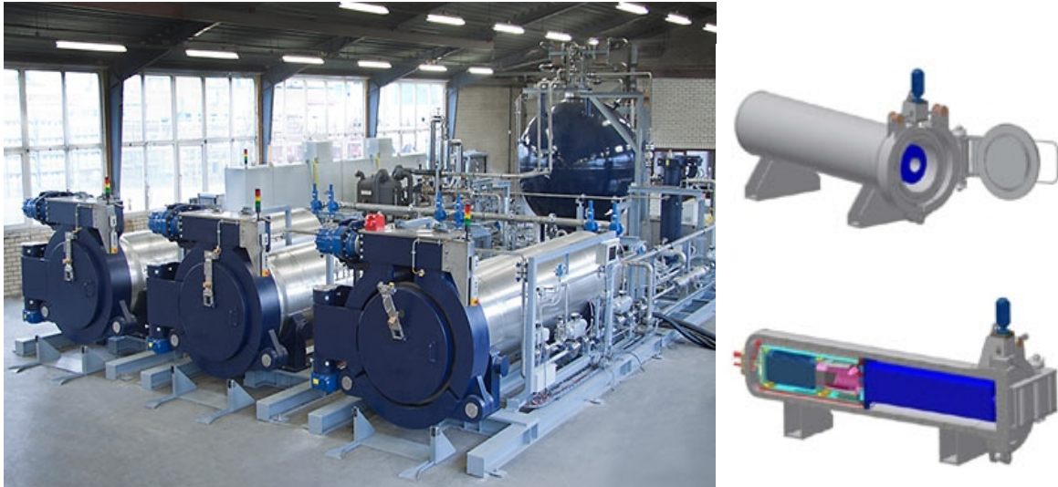
Figure 1. Commercial supercritical carbon dioxide beam dyeing machine developed by DyeCoo company [3]

Recently, for the first time, novel water-free fabric rope fabric dyeing machine in supercritical carbon dioxide fluid media was effectively designed, produced and built in a pilot scale plant (Figure 1) [3]. The results of the novel rope dyeing in supercritical carbon dioxide media were satisfactory and commercially acceptable with good wet-wash and rub color fastness levels (4 to 5 gray scale ratings) and color uniformity [2].