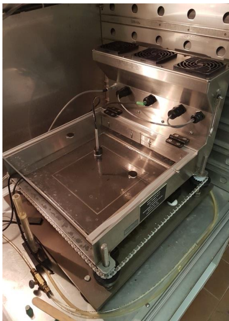
Figure 1. Sweating guarded hot plate, Measurement Technology Northwest

Thermo-physiological properties was determinate by measuring water-vapour resistance under steady-state conditions, using the Sweating Guarded Hot Plate [Figure 1]. The equipment simulates the flow of moist heat from the skin in the form of insensible sweating. The data is used to measure the water vapour resistance and determine the level of "breathability".