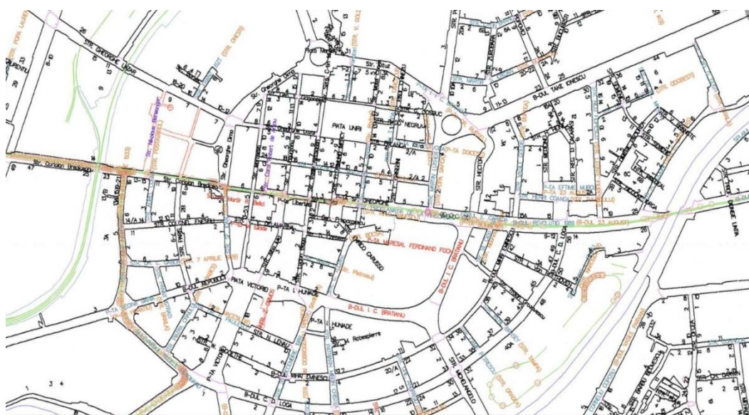
Figure 3 Timisoara central zone- extract from Urban GIS

A Geographic Information System (GIS) can be an important technological tool for making intelligent decisions regarding the sustainability of urban development in general and for our study, in Timisoara. The main reason for this project was to ensure the harmonious development of city with control over its expansion, [5].