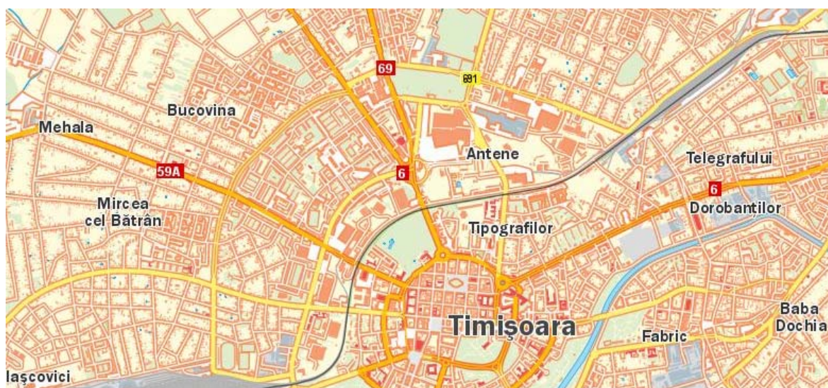
Figure 2 Urban GIS—districts of the city

The notion of GIS emerged in the early 90s, Timisoara City Hall is the first institution in Romania that which started work late 90s to achieve a GIS for urban purposes, currently this is one of the most advanced cities in this area with a system updated and managed daily, figure 2.