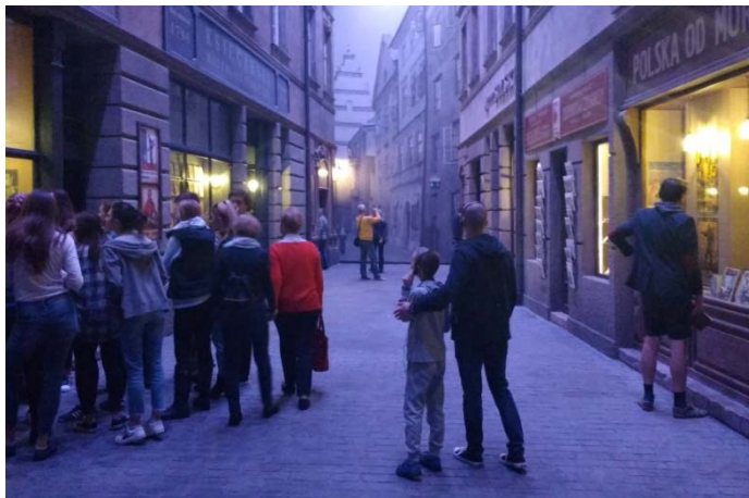
Figure 2. A pavement of Grossegasse street from before World War II used as a part of the exhibition