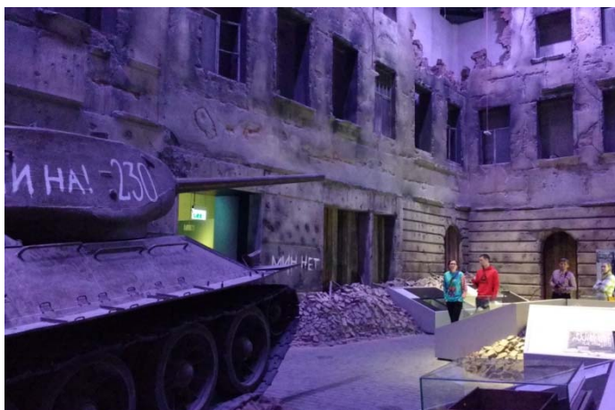
Figure 3. Visitors watching the exhibited tank, installed before the completion of structure

During the construction work, even before creating ceilings it was necessary to already place the largest exhibitions inside (like a tank) and building maintenance equipment (i.e. ventilation unit) in the underground part intended for the main exposure.