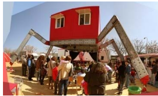
Figure 6. La Carpa- The artistic space built by occupying an abandoned area in Sevilla, 2012

a cheap and functional pretext to bring people together [32]. For the purpose of producing provocative, low cost, functional and mobile spaces for the benefit of the majority, he illegally occupies the abandoned buildings in Spanish cities. He is re-building these structures in cooperation with volunteers using waste materials or the ones obtained from abandoned buildings [33] (Figure 6).