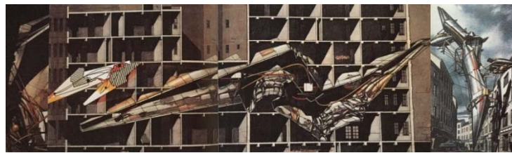
Figure 4. Berlin Free Zone and Zagreb Free Zone [27]

Architect Lebbeus Woods was critical of architecture being limited by technical, economic, legal and cultural factors objects to the physical and social orders and control mechanisms designed by the political authority and the dominant ideology. He has the desire to put up a fight against these authoritarian control mechanisms, to change the city models that have been controlled by hierarchy, politics and economy and to develop an architectural understanding that is devoid of such traditional prerequisites. Thus he came up with the concept of “free-space” [21] (Figure 4). He described free-spaces centring upon individuals for an ever changing society with non-rigid characteristics, where the functions of living spaces are defined by the users rather than the architects. He defined the role of the architect as a revolutionary, provocative and active participant [26].