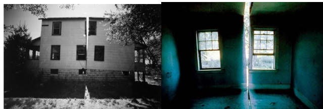
Figure 1. Splitting, 1974 [23]

He had performed his work that he named Splitting (Figure 1) in 1974, in a working class district in Englewood, New Jersey. He divided a ruined two storey house that he came across down the middle using a portable electric saw. He ripped the walls, the floors, the stairs and the windows in half starting from the roof down to the basement [20]. What has been done here is not constructing the house out of pieces as in the modernist approach; but to the contrary, to damage the house by way of breaking it up [22]. With this act of cutting, he challenged three basic principles laid down by Vitruvius [21].