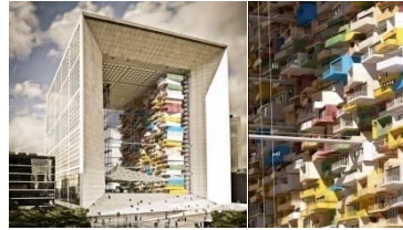
Figure 3. Self Defence (Pocket of Active Resistance), 2009

Défense district of Paris. Thus the valuable public spaces in the city centres are being occupied and made into an alternative living space for the outcaste [25] (Figure 3).