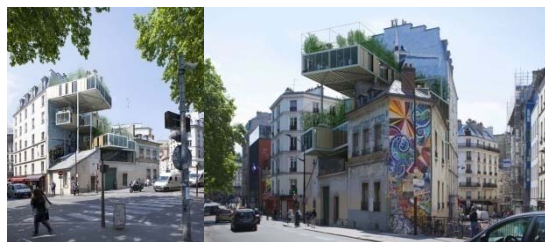
Figure 8. 3BOX, 2016

Architect Stéphane Malka criticising housing not to be within reach of everybody intended to build low budget housing without the costs of expensive building plots by using the gaps in the architecture of the city and preventing the problems of increasing urban growth and expansion [35]. In his “3BOX” project which he designed as a housing interposition in the city of Paris (Figure 8); he positioned modular, parasite flats that could be expanded according to the needs of the users on the rooftops of existing buildings. According to Malka, since these could be produced easily, in large numbers and cheaply, this could be the solution to the housing problem and thus housing is going to be within reach for everybody [36].