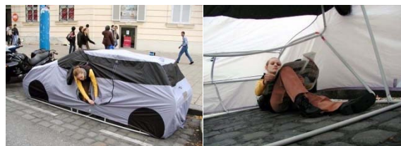
Figure 7. The pitching of P(LOT) project and its interior space, 2004

Artist Michael Rakowitz who criticised the inability of using the public spaces occupied by cars for breathing and conducting activities realised his P(LOT) project. With the project, on the hired car parking space, a car-like looking tent was pitched and thereby the inhabitants of the city was provided with a space where they can feel alone in the city [34] (Figure 7).