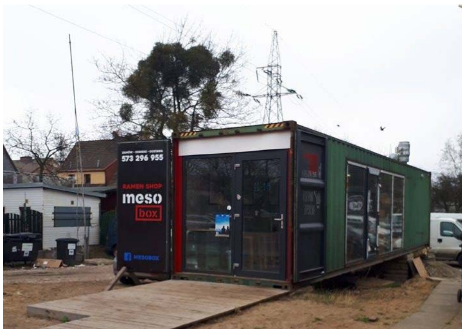
Figure 1. Small restaurant made out of 40' HC shipping container

Shipping containers are sufficiently sturdy to withstand the negative impact of weather during transport. They are also able to carry loads of up to 30 tons. This combination provides sufficient properties as base block for modular structure.