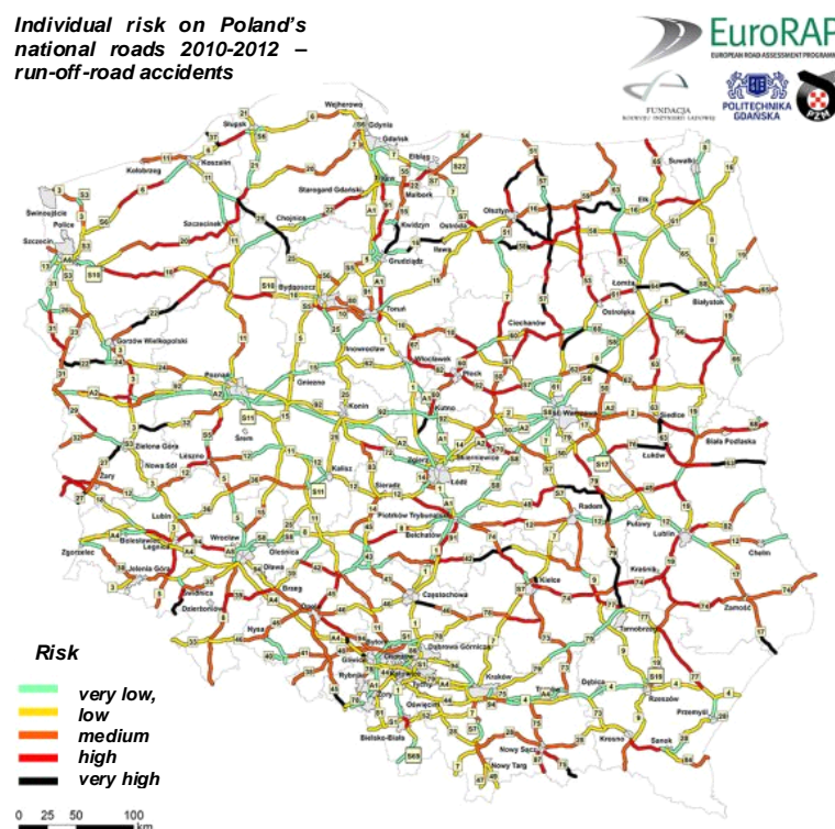
Figure 3 Map of individual risk on national roads – run-off-road accidents

A major problem for this level of management is to obtain permits to fell roadside trees posing a hazard to road users. The process can be helped by a recent Supreme Chamber of Audit report on road safety management which addresses this particular problem (NIK, 2014). Operational risk management occurs primarily when road structures are built, operated and deconstructed. This is delivered by local road authorities and local authorities.