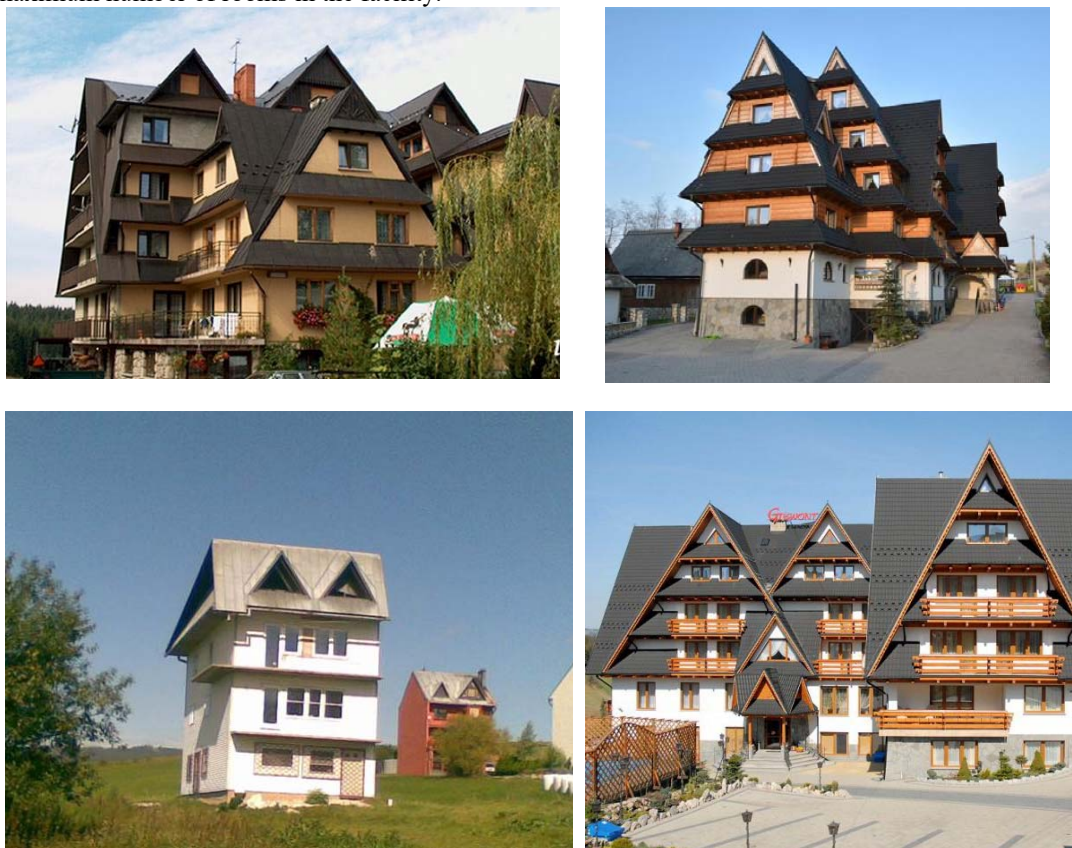
Figure 6. Contemporary architectural forms in Podhale: A- A holiday house “U Tośki”; B- Accommodation „U Jakuba”- Stachonie; C- A single family house Kokoszków-Nowy Targ; D- A holiday home Giewont Murzasichle

And how does the modern architecture of Podhale present itself? The affirmation of the Zakopane style opened the way to the variations about it, not always accurate. In addition, the architectural and building regulations that provide a rigid framework to the principles of forming the solid, did not correspond to the social demands. The ongoing pressure of the tourist traffic on Podhale and the “fashion for Zakopane” 9 were intensified by forcing more homes for the holiday-makers. The shape of the present architecture of Podhale is a resultant of adaptation to the urban conditions and attempts to push the maximum number of rooms in the facility.