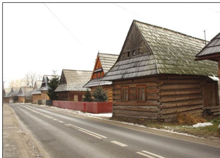
Figure 2. The original layout of the Podhale village has been preserved in Chochołów. Over time, in order to meet the competitiveness of the accommodation or to increase the usability, houses were rebuilt from one to two tracts, porches were added, lofts have been utilized, etc. variations