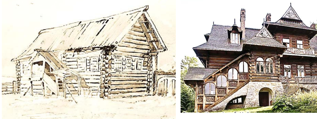
Figure 3. The roof over the stairs – an element unknown to the region of Podhale, and found in the East-Russian architecture. A – a sketch by Witkiewicz presenting the Russian folk architecture; B- the “Pod Jedlami” villa by S. Witkiewicz. Summary based on the materials of the Tatra Museum

were created based on the prototypes. This caused a certain change in the body of the building “four”), however, the main features characterising Podhale were long preserved. The Zakopane style is the first example in Podhale of the “designed” architecture... although not by an architect. Searching for the national style for the Polish architecture was at the base of the Zakopane style. It was not an activity detached from the young Polish tendencies of that time, which affirmed the simplicity of life and potential dormant in the countryside 5 . The youth of the creator’s style spent in Russia was most probably reflected later on in the style created by Witkiewicz in the form of details unusual for Podhale 6 .