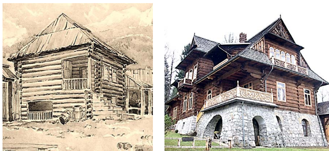
Figure 4. Corner balconies – niches not found in the architecture of Podhale, quite popular in the architecture of central and eastern Russia. A- a sketch by Witkiewicz, B- the “Pod Jedlami” villa.

Summary based on the materials of the Tatra Museum