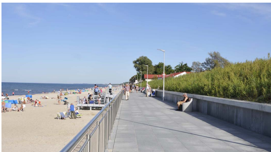
Figure 5. Coastal area in Sabinowo – the transformation project of coastline strengthening by Adam Borodziuk, [8].

Moreover, due to the way of shaping the form of the coastline and its strengthening, all cases are examples where new development is planned which arises from the needs and the principles of sustainable development. One of the effects of this part of coastline transformation are elements created in the form of terraces falling towards the beach and water, always allowing access to the water. These elements are important points of the open space network. By maintaining the flexibility of the created system it can be adapted to unforeseen weather circumstances.