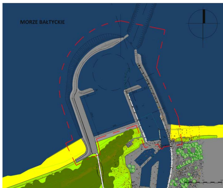
Figure 4. Ustka – the proposal to shape the elements of new port concept of new port /scheme of the designed construction as a part of public space network, [8].

The Ustka structure transformations projects show how important it is to create a safe coastal zone. This is also a model of hydro-technical forms, which ensures visual relationships with water. The presence of water is seen even from places not only located near its edge. It was possible to take full advantage of this zone by leading the main pedestrian path to the beach and by creating an overhead walking structure whose main role is to protect the city structure during storms.