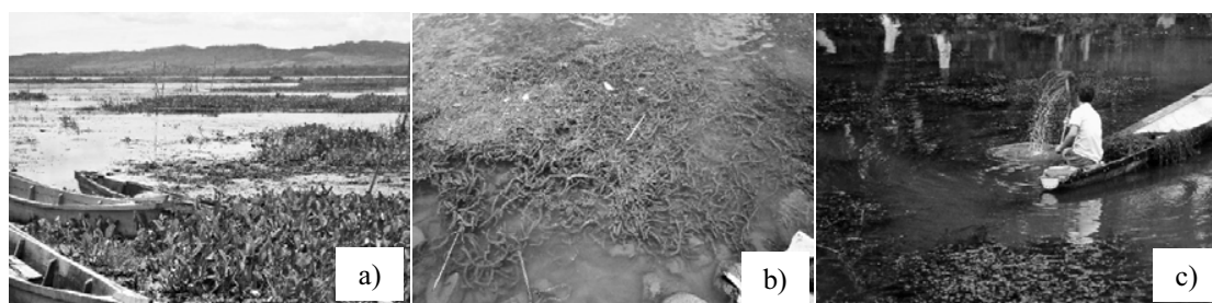
Figure 1. Aquatic pollution of Lake Toba: a) Eichhornia crassipes , b) Hydrilla verticillata , c) Myriophyllum spicatum (manual harvesting) [Authors data]

There was monitored and evaluated presence of mentioned plants populations, which are considered as an aquatic pollution, in the water areas of Lake Toba (see in Figure 1), the largest lake (surface area 800 km 2 ) in tropical Asia located in the middle of North Sumatra [5, 8, 9]. Lake Toba, represents frequently visited tourist destination and is considered as a natural wonder, therefore there is an effort to eliminate the population of undesirable aquatic weed species [10]. Mentioned aquatic plant species are characterized by extremely high biomass yield which forms desirable thick impenetrable mats at the bottom and surface (large floating islands of plants) of the lake [10, 11] which exclude other vegetation growing and complicate utilization of water areas (activities such as fishing, irrigation, energy generation or recreation) [12]. To prevent all mentioned negative impacts of identified aquatic plant species, the existing plants populations are removed from water by manual or mechanical harvesting (heavy machinery) in attempt to clean the lake and prevent further plants reproduction [8, 13]. Identical harvesting techniques were also documented in case of aquatic pollution of Lake Rawa Pening, Central Java [14] and Lake Tempe, South Sulawesi [15].