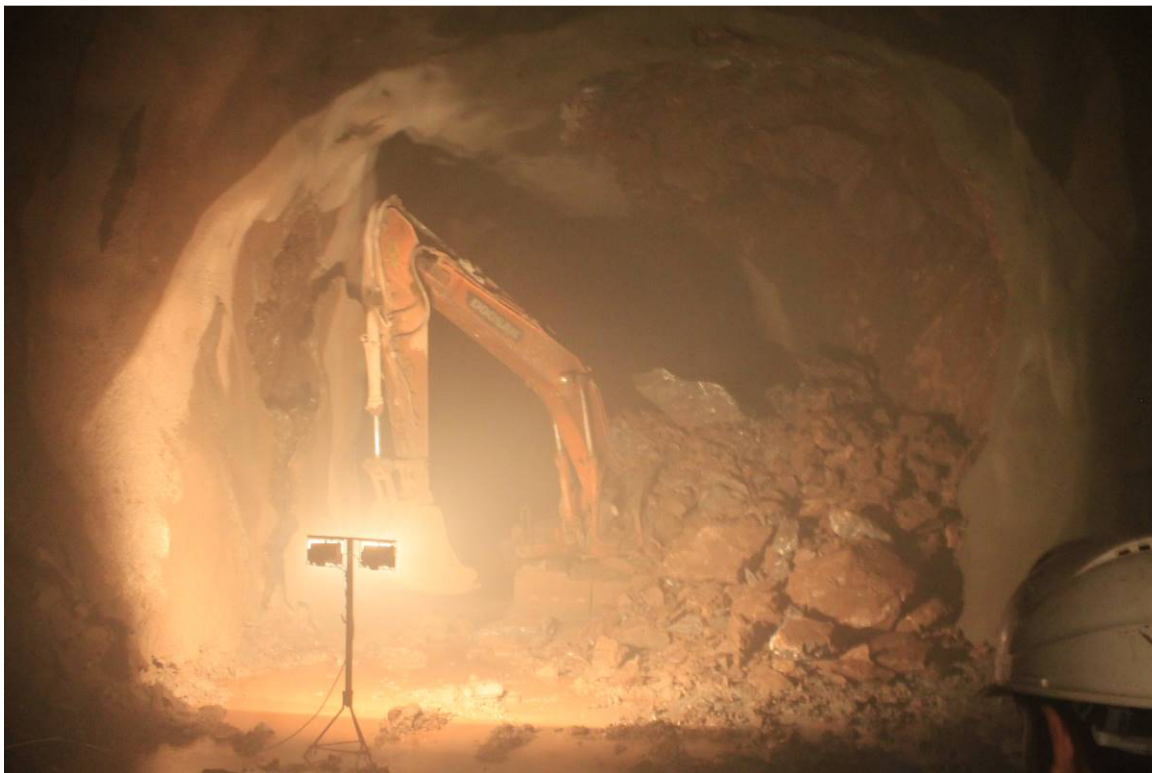
Figure 4. An excavator buried by collapsed rock support and surrounded rock mass. The photo taken during time when rock was still falling and shotcrete lining was cracking. An excavator operator was pulled out alive.

Depending on the reasons remedial actions could be paid solely by a contractor, a client or expenses can be shared between them. It is a supervision who has to guide this process. Contractors usually try to include the provided remedial works into claims regardless true reasons. Therefore, it is of a paramount importance to keep all the necessary relevant information related to NCRs. Furthermore, contractors are often directly penalized for any issued NCR according to contract conditions.