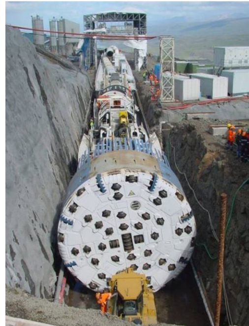
Figure 3. A 7.6m diameter hardrock TBM prior to the excavation of a 14km long headrace tunnel in Iceland.