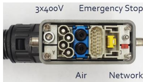
Figure 1. Modular USB plug for machines developed by SmartFactory KL partners.

With more than 47 international partners from both industry and academia, the " Technology Initiative SmartFactory KL " (SF) is one of the first to adapt or extend various standards into a functional and industry-ready production prototype demonstrator for small series production. The description of the demonstrator is out of the scope but can be accessed at [17].