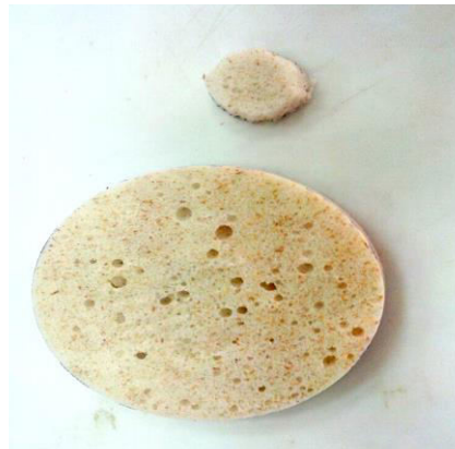
Figure 1. Polymer foam composite (PF).

The foam samples were prepared by once shot method. RM ( <200\mu\text{m} size) with the percentage of 5%, 10%, 15% and 20% respectively were used as filler. The polyol is reacted with cross-linker with correct proportion ratio of 1.0:0.5 (wt/wt %). The formulation used as shown in Table 1 . The foams are made with an uncured polyol, mixed with isocyanate and then cast into a mold. The mixture is left to cure at room temperature for at least 6 hours. After completely cured, the foam samples thickness is measured using Teflon mold of 100 mm diameter and 28 mm diameter. This is to cut the foam samples in accurate thickness and diameter as shown in Figure 1 [2]. The thickness is cut in 10 mm, 20 mm and 30 mm using a blade and labelled as neat polymer (PU) foam. The added filler of RM in the polymer is namely as polymer foam composites (PF).