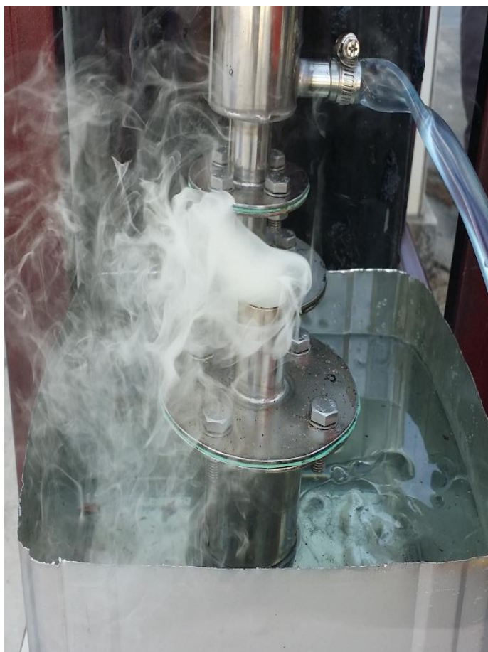
Figure 5. Pyrolytic bio-gas flared to atmosphere.