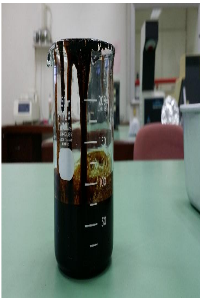
Figure 6. Liquid bio-oil obtained from slow pyrolysis of rice-husk.