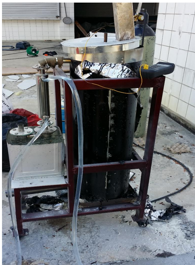
Figure 3. Fixed bed pyrolysis experimental set-up.

The set-up is assembled and sealed using rubber and liquid gasket. Nitrogen gas is supplied from a nitrogen gas cylinder to the reactor which is controlled by a gas flow regulator. The reactor is maintained at a low temperature range of 390 to 410°C at an apparent vapour residence time of 30 min. It is heated by means of a heater of biomass source to attain necessary heating in order to achieve the temperature in the range of 400°C. The water-cooled condenser condenses the vapours into liquid oil which is collected in the ice-cooled liquid collectors while the gas is flared into the atmosphere. After the completion of the pyrolysis run for 60 min, the system is cooled down and dismantled. The bio-char retained in the reactor is collected at the end of each experimental run. The liquid products are then collected and weighed. The amount of gaseous products is determined by difference.