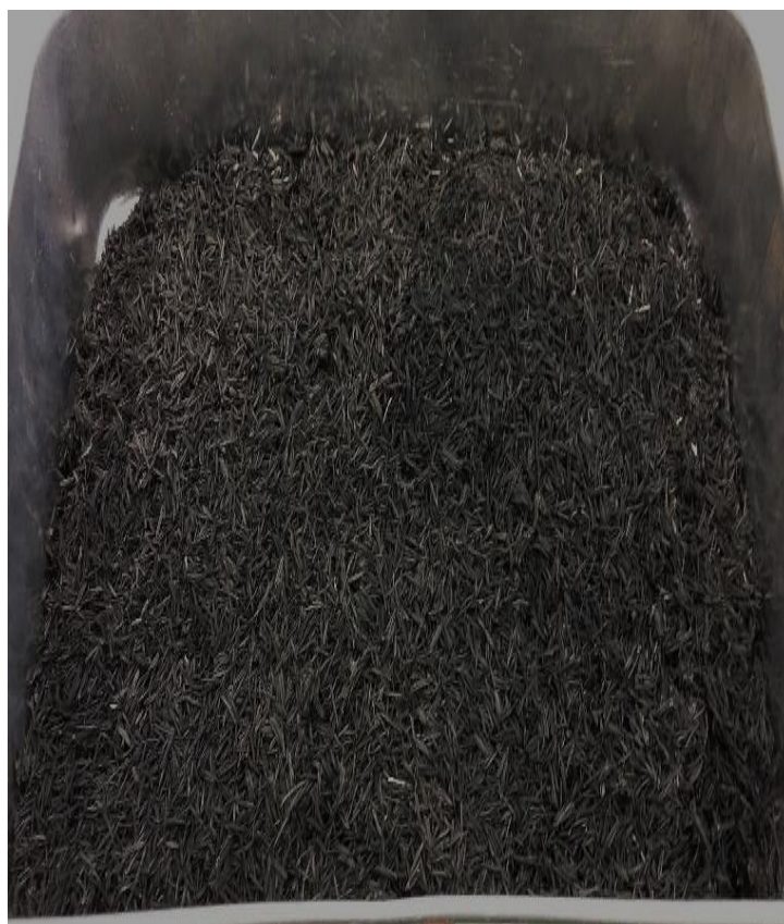
Figure 4. Solid bio-char obtained from slow pyrolysis of rice-husk.

referred as bio-char. The solid char is found to be 45% by weight of the total solid biomass feedstock in this study. The bio-char obtained is shown in Figure 4. It is found that the char retained the original geometrical shape of the rice husk feedstock particle with a dark black colour. The product yield is found to be in good agreement with the results of other pyrolysis studies conducted by Islam [3] which was found to vary in the range of 40 to 53 wt% of solid biomass feedstock in case of rice husk and oil palm shell. However, Jahirul, Rasul, Chowdhury and Ashwath [4] reported the char yield to be a maximum of 35 wt% of feedstock. The char product yield obtained in this study is found to be higher than the solid product yields obtained by Williams and Besler [14] in their experimental studies on rice husk pyrolysis. However, their study was at higher reactor bed temperature.