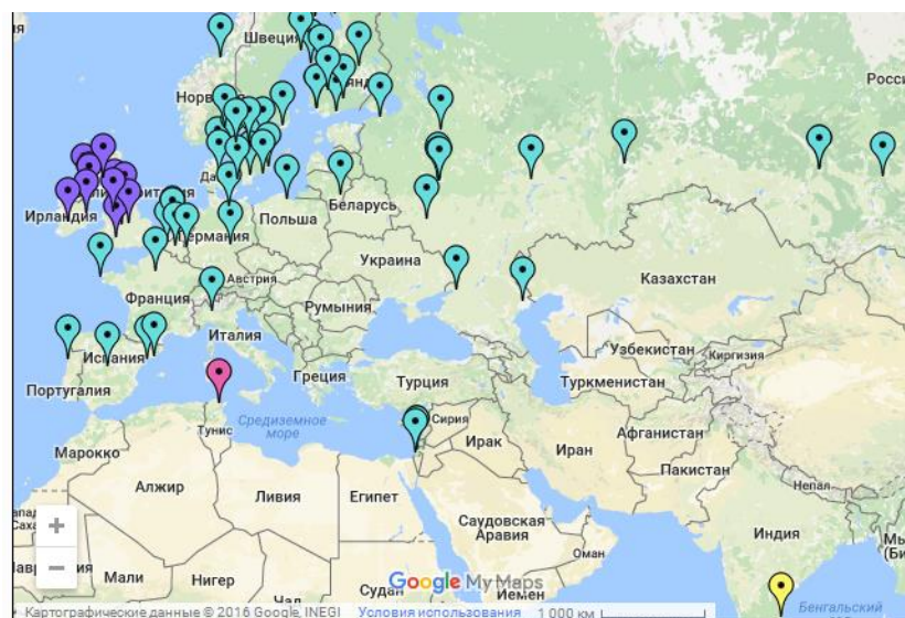
Figure 2. Part of the map of the current CDIO member schools [16]

The framework CDIO provides students with an education stressing engineering fundamentals set in the context of Conceiving — Designing — Implementing — Operating (CDIO) real-world systems and products [17]. CDIO is mostly based on PBL [10]. 77 world's universities have joined the CDIO initiative as of today (no universities in Ukraine, Figure 2).