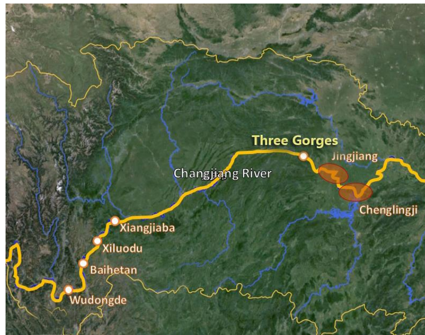
Figure 1. Location of reservoirs and flood control objects

Jingjiang area is a nickname of area from Zhicheng city to Chenglingji section in the Yueyang city along the Changjiang River, with a total length of 360 km [11]. The north shore of Jingjiang area is the Jiangnan plain, and the south bank is the Dongting Lake plain. Due to sediment deposition, the river bed is higher than the plains, and becomes an aboveground river, which is very easy to burst flood disaster.