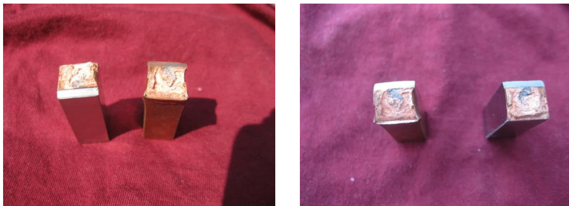
Figure 2. Impact fractured sample on ferritic stainless steel and copper

The impact test is conducted as per ASTM standard and impact values of the welded joint are listed in Table 4. On the basis of the impact strength of dissimilar friction-welded joints, the fractures occurred in the weld interface is shown in Figure 2. The experimental values of impact toughness values were ranged from 14 to 46 J/cm 2 . As upset pressure decreased, the toughness decreases results in lower value of 14 J/cm 2 . When the upset pressure increases, the joint was evidently superior to that of lowering upset pressure and results in higher value of 46 J/cm 2 .