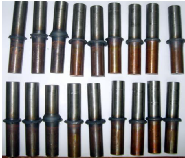
Figure 1. Friction welded joints