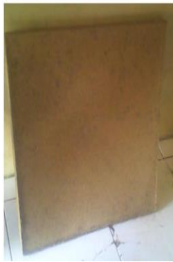
Figure 1(a). Composite particle board.

catalyst mekpo, (2) Sample B: 75% MGMW + 24% polyester resin + 1% catalyst mekpo, and (3) Sample C: 70% MGMW + 29% polyester resin + 1% catalyst mekpo. The first is drying the MGMW under the sunray for about two days and then it will be sieved by size 1.5 mm. The second step is the MGMW is dried again in the oven at temperature of 90°C for six hours. If the the MGMW is really dry (free from the humidity), it can be mixed with polyester resin and catalys, and poured into a mold length x width x height (40 x 40 x 1.5) cm and then is pressed by the hot press machine with pressure of 50 kg/cm 2 at 130 °C for 30 minutes. After it reversed and press again for ± 30 minutes at the same temperature. The results of hot press is composite particle board is shown in Figure 1(a) and further subdivided to form the sixth section ( Figure 1b ) on physical and mechanical testing on composite particle board according to the JIS standard A 5908-2003 [2] and Standar Nasional Indonesia (SNI) 03-2105-1996 [3] includes some tests, they (for physical testing) are density and moisture content (number 5), internal bonding/IB (number 3), swelling in thickness after immersion in water, and strength of absorbtion water (number 4). Mechanical testing are modulus of elasticity/MOE (number 1), modulus of rupture/MOR (number 2), and strength of screw holding (number 6).