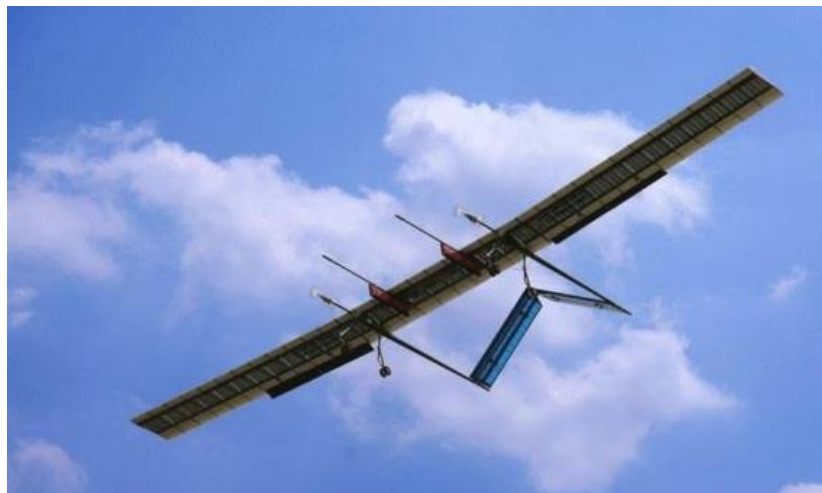
Figure 9 "Rainbow" solar powered UAV

2.2.2. "Green Pioneer I" solar aircraft. "Green Pioneer I" solar aircraft is the green pioneer program's first generation of sample machine(as show in Figure 8). "Green Pioneer I" uses a layout and structure of new and reasonable composite flying wing aerodynamic layout. The whole machine, the lower wing surface set up a high conversion rate of flexible solar arrays as a power and control, task equipment, energy collectors. "Green Pioneer I" wind tunnel experiments and field flight experiments show that China's composite wing program than the current layout of other forms of advantage, is China's solar energy aircraft design a major initiative.