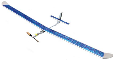
Figure 7 "Soarer" solar aircraft