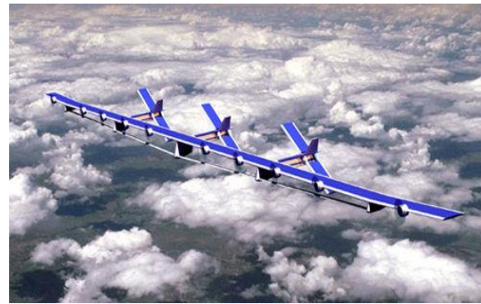
Figure 4 Loma's "Norma" UAV program