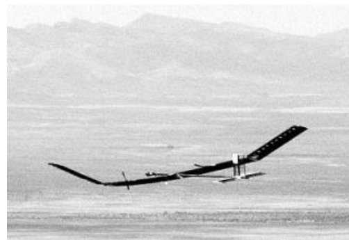
Figure 2 " Zephyr 7"UAV

2.1.2. "Zephyr 7" UAV. "Zephyr 7" UAV is designed by the United Kingdom Qinetiq Company. A large number of carbon fiber composite materials used in the solar powered UAV, and is the embodiment of the top technology of solar aircraft(as show in Figure 2). During the day, it use a thin film amorphous silicon thin-film batteries to absorb solar power to cruise at 18km high, at night it flight by the lithium-polymer battery witch energy is 2 times of the lithium-sulfur batteries [8]. In order to save energy, it glide down with dynamic. The wingspan is about 22.5m, total mass is 53kg, it has the lightest structure density in the unmanned aerial vehicles (0.8kg / m 2 ). In July 2010, 336 hours of continuous flight at 21.6km, creating a new UAV continuous flight time. Airbus said in a statement, the first "Zephyr" -8 UAV has been under construction, and will begin first flight in mid-2017 maiden voyage.