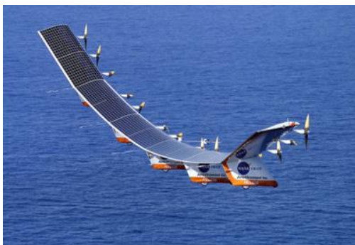
Figure 1 " Helios " UAV

2.1.1. "Helios" UAV. "Helios" UAV, developed by NASA and the Aeronautical Environment Corporation (UAS), use a large aspect ratio (31) wing layout to improve aerodynamic efficiency and is designed centre on the utilization of solar energy(as show in Figure 1). Wingspan 75.3m, area 183.6m 2 , with 62120 pieces of solar cells, can provide 40 kilowatts of power, driving 14 propellers flight, high-altitude model weight 720kg, long-time model weight 1053kg. In August 2001, the high-altitude model hit a record of 29,524 miter, it was the highest propeller-driven UAV in the world that time [5-7].