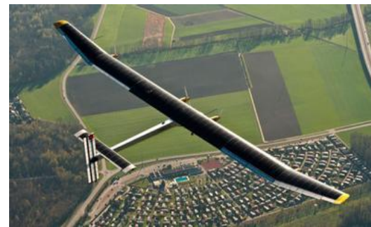
Figure 6 "Solar Impulse 2" solar aircraft

2.1.4. "Solar Impulse 2" solar aircraft. "Solar Impulse 2" solar aircraft is designed by the sun team of high-altitude long-endurance manned aircraft, whoosh's flight required energy entirely from solar cells. A large number of new carbon fiber composite materials are used in the aircraft's manufacture (as show in Figure 6). The wingspan is 72 meters, weighing about 2300kg, the aircraft installed 17,248 thickness of only 135 micron monocrystalline silicon solar panels, can produce 340 kilowatt hours of electricity per day, driving four power 13.5 kilowatts of DC brushless, no Sense of engine work and charge 633 kg of lithium-ion battery. Beijing time March 9, 2015 to April 23, 2016 evening, "Solar Impulse 2" solar aircraft from the UAE capital Abu Dhabi departure, divided into eight sections of the Genesis manned world flight, and created the longest Distance single-person flight records. During the overheating of the battery problem, rest for 10 months. Local time at 4:00 on July 26, 2016 "Solar Impulse 2" successfully landed in Abu Dhabi.