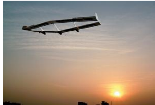
Figure 8 "Green Pioneer I" verification machine

2.2.2. "Green Pioneer I" solar aircraft. "Green Pioneer I" solar aircraft is the green pioneer program's first generation of sample machine(as show in Figure 8). "Green Pioneer I" uses a layout and structure of new and reasonable composite flying wing aerodynamic layout. The whole machine, the lower wing surface set up a high conversion rate of flexible solar arrays as a power and control, task equipment, energy collectors. "Green Pioneer I" wind tunnel experiments and field flight experiments show that China's composite wing program than the current layout of other forms of advantage, is China's solar energy aircraft design a major initiative.