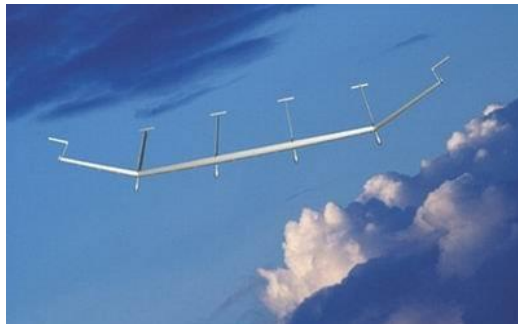
Figure 5 "Solar Hawk" UAV program