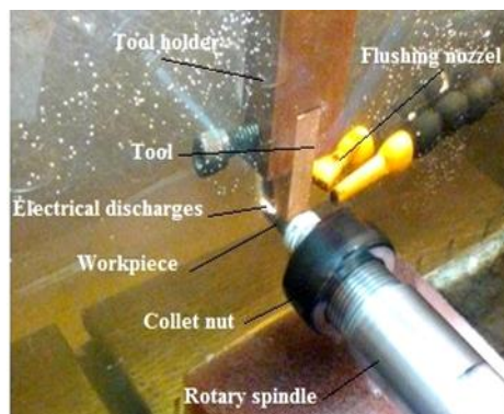
Figure 1. Concept of EDT process.