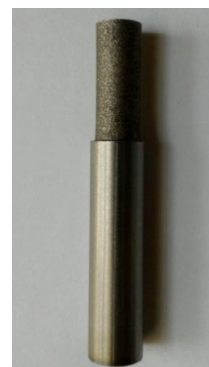
Figure 2. A cylindrical EDT part.

From the above literature it is found that several researchers have contributed to the development of EDT process. However, because of its stochastic nature the full potential utilization of this process is not completely solved. So the need has been felt towards the highlighting this process and explores the possible ways to adjust its parameters to enhance the process performance. This paper presents a study on straight turning of titanium alloy using preshaped solid copper electrode. This has been done by determining significant factors using ANOVA technique. Regression analysis than conducted to establish a relationship between factors and response. Finally signal to noise ratio (S/N) analysis is conducted to find the optimal settings and factor levels. Therefore optimal process parameters are verified through the confirmation experiment.