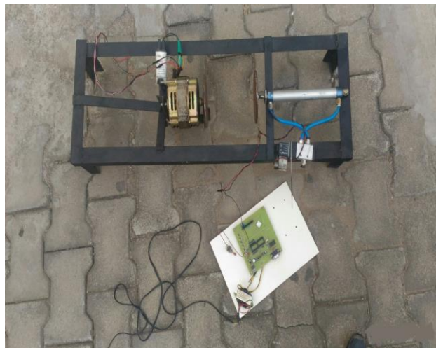
Figure 3. Prototype model.

The prototype model of the automatic clutch operating system shown in figure 3 consists of non-return valve, unloader valve, solenoid, pneumatic cylinder and vacuum cylinder.