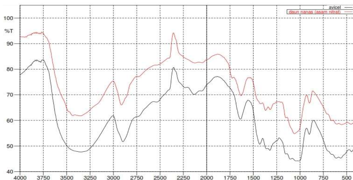
Figure 2. Overlapping Spectrum of Microcrystalline Cellulose from Pineapple Leaves with Standard Avicel

From the figure above results obtained fourier transform infrared spectrum of microcrystalline cellulose from pineapple leaves, where the wave number 3352.28\text{ cm}^{-1} shows the OH stretching vibration. Absorption band at wavenumber 2912.51\text{ cm}^{-1} showed the presence of C-H aliphatic stretching vibration supported by an absorption band at wavenumber 1423.47\text{ cm}^{-1} and 1369.46\text{ cm}^{-1} , which showed the presence of C-H aliphatic bending vibration. In wavenumber 2125.56\text{ cm}^{-1} and 2058.40\text{ cm}^{-1} indicate the presence of O-H vibration. Absorption band 1631.78\text{ cm}^{-1} shows the C = O bending vibration [10]