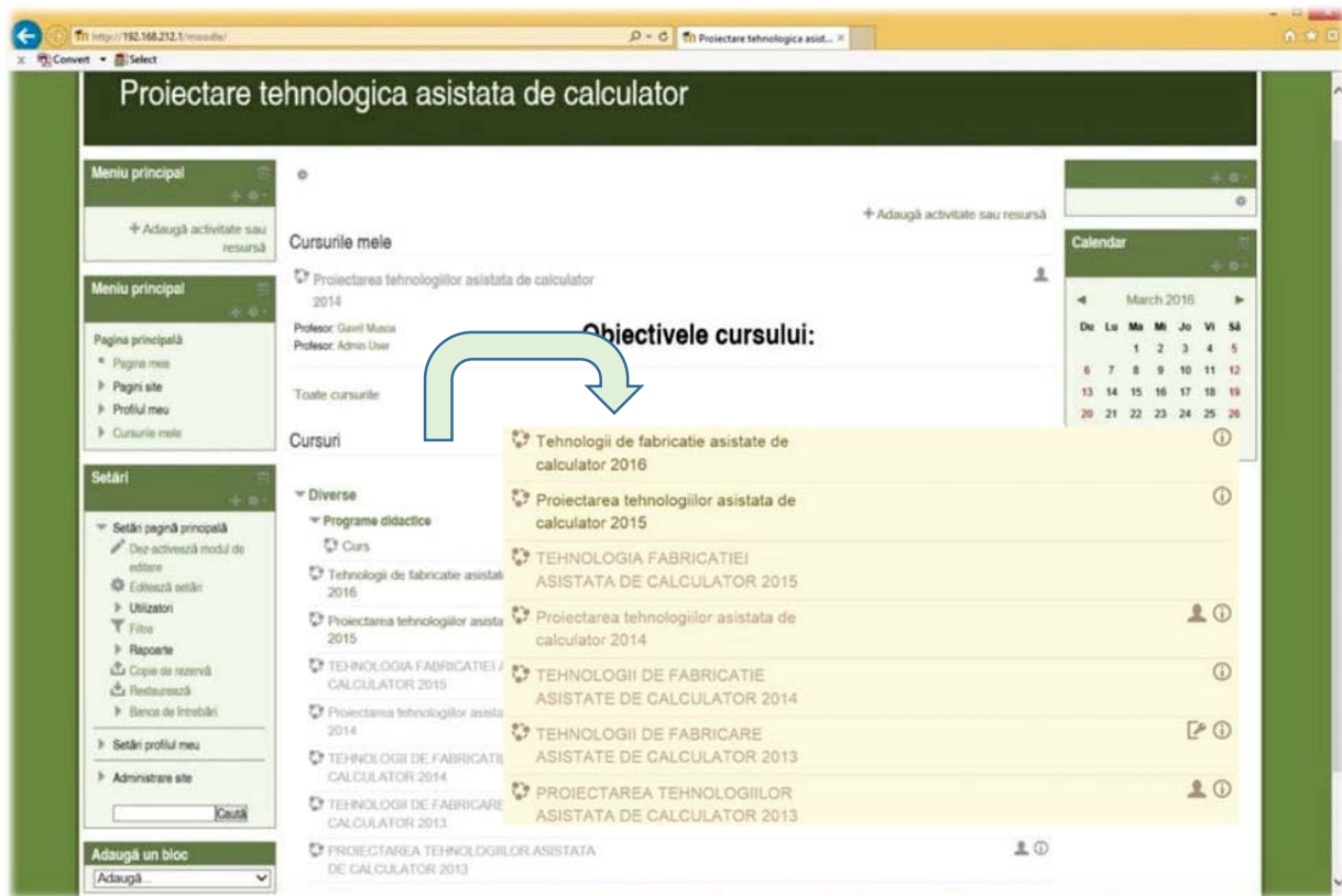
Figure 1. General view over the e-learning system CAD/CAM/PLM orientated with details about course studies that it contains.

Keeping in mind the above presented reasons and benefits, the Machine Manufacturing Technology Department from the Technical University of Iasi has implemented inside the CAD/CAM/PLM laboratory an e-learning educational system based on Moodle (v.2.6) as shown in figure 1. The first variant has been developed and used back in 2013 and at the present time the platform contains 7 courses studies and has been used by more than 650 students from both graduate and master studies. Even though subjects are related each course study is original because the authors have adapted them to trainee's specific activities and knowledge. The available resources for students contain manuals elaborated by the authors, tutorials and product documentation for each software solution used in the laboratory (Solid Edge, NX CAM, ESPRIT, and CIMCO), scientific articles and links to relevant content website.