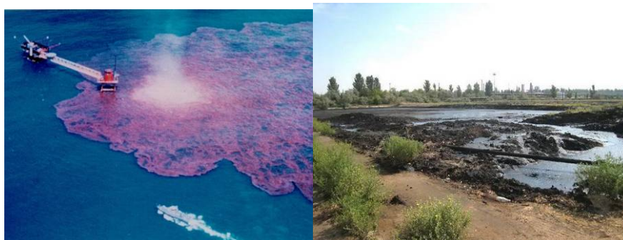
a) offshore [1]

Common methods of characterizing volatility of petroleum and petroleum products can be divided into two groups: experimental (direct and indirect) and theoretical. Direct methods include measuring the fluid volume before and after evaporation or calculating the vapor volume (mass). Direct determination of hydrocarbon emissions is extremely difficult, and in some cases impossible, especially for short-term storage encountered in emergency situations. For example, when determining emissions by measuring the oil level h_{B3} a basic rule of measuring technique is violated, according to which a small value must be obtained by direct measuring, rather than subtracting two inaccurate values.