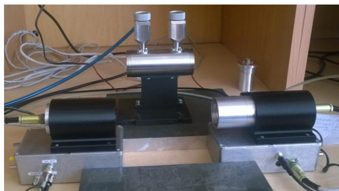
Figure 2. The prototype of an open path LED-based methane analyzer

In detection bloc “LED Microsensor NT” NIR photodiode is used with following characteristic: cut off at wavelength 2.45\ \mu\text{m} , sensitive area diameter 0.3\ \text{mm} , detectivity 2\cdot 5\cdot 10^{10}\ \text{cm}\cdot\text{Hz}^{0.5}\text{W}^{-1} . The whole view of the prototype of an open path methane analyzer with the gas cell is given in Figure 2. It was shown in [12], that it could be used for alarm systems.