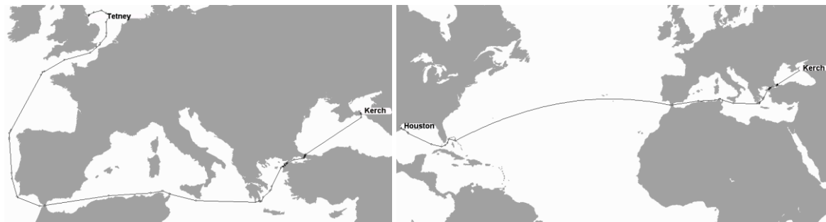
Figure 2. (a) Tetney, UK to Kerch, Ukraine, 3/07/2013 – 25/07/2013

The analysis covers one complete voyage, figure 2, carried out during the third quarter of 2013. The real EEOI was calculated for this voyage. In this context, “voyage” is considered the period between the departure from the previous loading port, Tetney (UK), to the departure from the discharge port Sabine (USA).