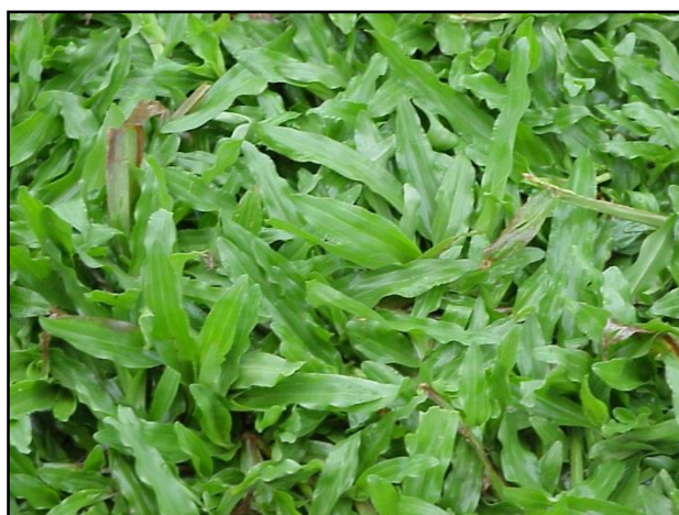
Figure 2. Cow grass ( Axonopus Compressus ).

Proper planting equipment and methods must be used in establishing an effective grass lining. The grass origins and strains are known to be adaptable to the site so that the grass can be tolerant to flooding and be able to survive and continue to grow after the inundation period. Grass height of 50 mm to 150 mm should be maintained with a maximum grass height not exceed more of 150 mm [22]. Heights, types, and conditions of the vegetation are the factors that contribute to changes in the flow characteristics of the swale and its roughness coefficient. As the submergence starts to occur in the swale, the vegetative roughness coefficient tends to remain constant or rise [11].