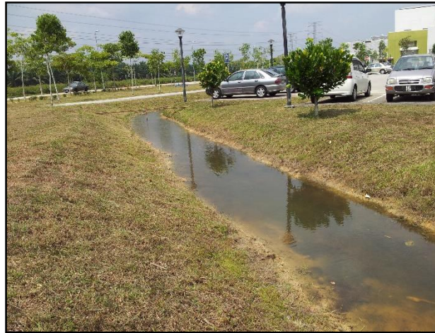
Figure 1. Grassed swale in UTHM.

swales can be function properly to reduce the risk of flooding. This study was conducted in the campus of Universiti Tun Hussein Onn Malaysia (UTHM). The aim for this study is to investigate the variations of roughness coefficients with the flow depth of grassed swales in UTHM. The variations of roughness coefficients of grassed swales are presented in Manning's equation. Figure-1 shows the grassed swale in UTHM. The hydraulic parameters involved in this study are cross-sectional area (A) of swale, flow velocity (V), flow depth (Y), wetted perimeter (P), hydraulic radius (R), and longitudinal slope (S). The findings of this study give an extensive understanding to the hydraulic characteristics of grassed swale, where the suitable swale design can be proposed especially in the application of sustainable stormwater drainage system within UTHM campus.