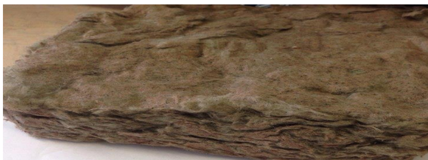
Figure 2. Mineral binder insulating material.

Moreover, the mineral binding agent can withstand minimum 1000 °C making it possible to operate with mineral binder insulating materials in high-temperature environments without emitting carcinogenic substances.