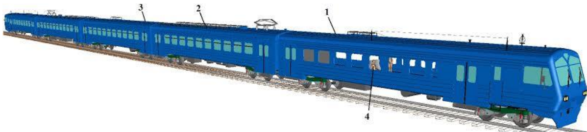
Figure 2. A solid-state computer model of an electric train:

The comfortableness assessment of a home electric train with systems of car body constrained inclination in curve tracks was also carried out (Figure 2).