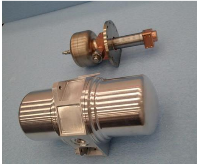
Figure 1. Photo of RAM-100 Compressor and Expander.