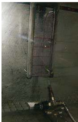
Figure 1. ULC specimen (Trial 1) during single-flame source test.

2.3.2 UL94-Vertical flammability test. The UL94 (Underwriters Laboratories, USA) test allows the determination of plastics flammability characteristics [29]. The standard classifies plastics according to their burning behaviour in different orientations (horizontal or vertical burning tests) and thicknesses. The vertical method was used in this study. The specimens (125x13x5 mm 3 ) were supported vertically and a flame was applied to the bottom of the specimen (figure 2). The flame was applied for 10 s and then removed until flaming stops, at which time the flame was reapplied for another 10 s and then again removed. On the basis of overall results for a sample of five specimens, materials can be classified as V-0, V-1, V-2 or unrated (U).