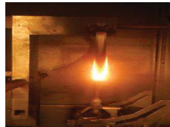
Figure 2. ULC specimen (Trial 4) during vertical UL-94 flammability test.