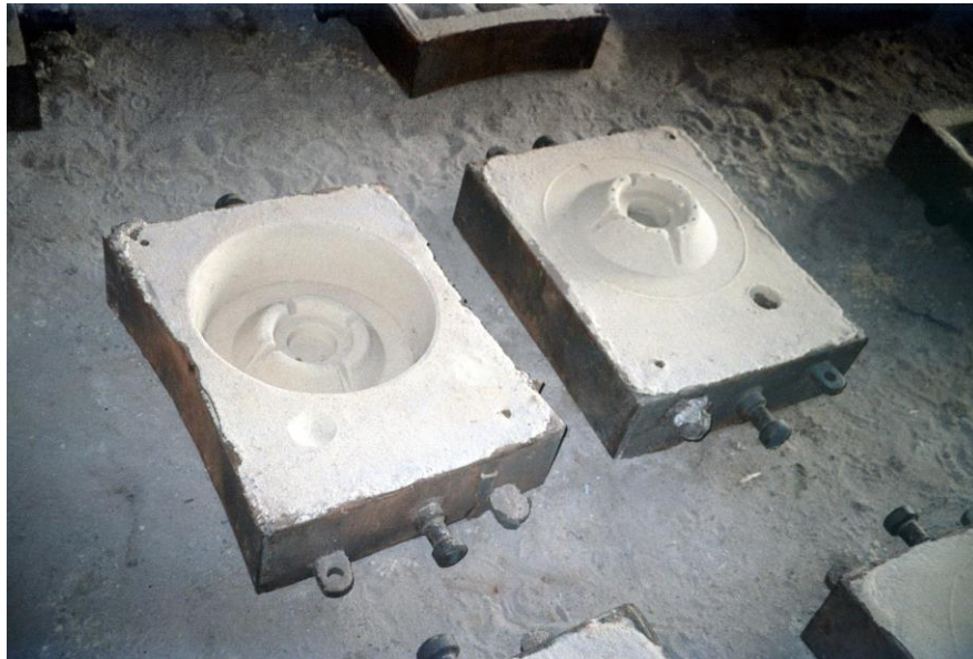
Figure 3. The mould parts (upper and lower) performed.

Prevention of adherences is realized using anti adhesive powders, which are used only for casting into the green-sand moulds, this forming a layer with high refractory on surface of the green-sand mould. This layer prevents direct contact between molten alloy and walls mould. Refractory powders most frequently used are: graphite powder, quartz powder; milled talc, Portland cement.