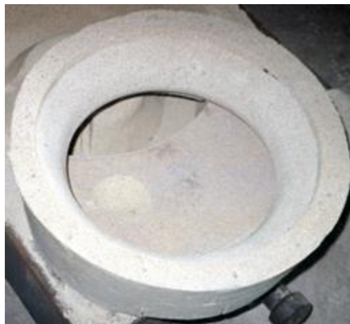
Figure 2. The lateral core.

To making the core is used the core mixture, with the following composition: 98% new sand; 1,6% bentonite; 1...2,5% oil flaxen; 0,5...1,4% dextrin. The mixture characteristics are: permeability: 100UP; levigable component: 2%; humidity: 2...3%; compressions strength: 0,15...0,3daN/cm 2 .